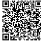
Scholarship Details 獎學金詳情

PolyU SPEED 學士學位銜接課程學生 (2025/26 學年入學) 有機會獲頒獎學金合共最高 HK$110,000。