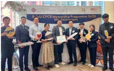
Welcome Ceremony for PolyU CPCE Mentorship Programme 24/25 師友計劃 24/25 學員與導師聚會