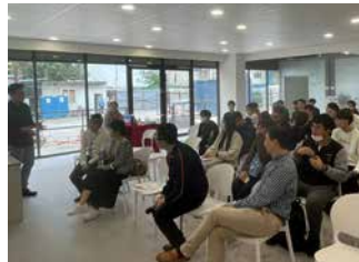
Briefing by Industry Practitioner at Site Visit 由業內項目經理主持地盤簡介