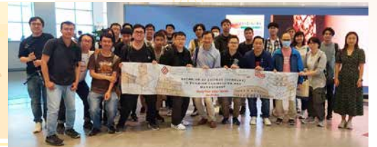
International Study Tour 国际游学团

Graduates are able to pursue a wide range of careers, including engineering posts in Building Construction and Civil Engineering works as well as Project Management and Contract Administration, and Quality Surveying posts 毕业生就业机会包括建造和土木工程、项目和合约管理，以及工料测量等职位