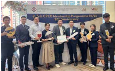
Welcome Ceremony for PolyU CPCE Mentorship Programme 24/25 师友计划 24/25 学员与导师聚会